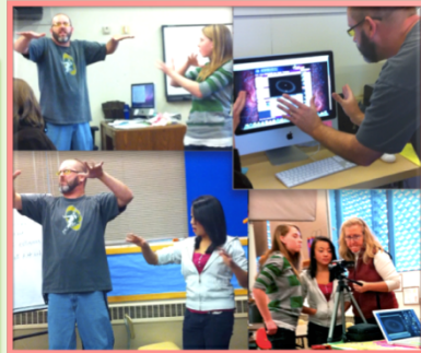
Create an ASL video to narrate simulations.