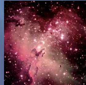
K16 Magor's rendering of the Eagle Nebula (M16, IC 507, Sh 2-28) and Violet Flares from KPNO 8m Telescope at Cerro Parí taken by students in NOAO's 2004 TARBEE program, plus a 6th IR layer, processed at Saint Joseph's High School with Photoshop using NASA's FITS Liberator.