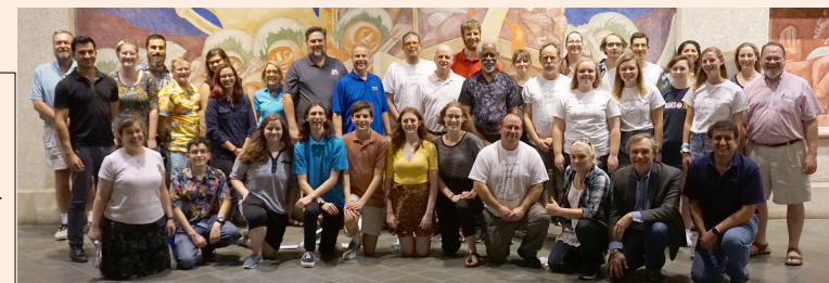
Photo from 2020 AAS: 2019 class (2 teams) finishing up; 2020 class (2 teams) starting up; AND alumni who raised their own money to come!

We're presenting results. We have 68 science posters, 71 education posters, 8 astronomy research journal articles, and 6 education journal articles.