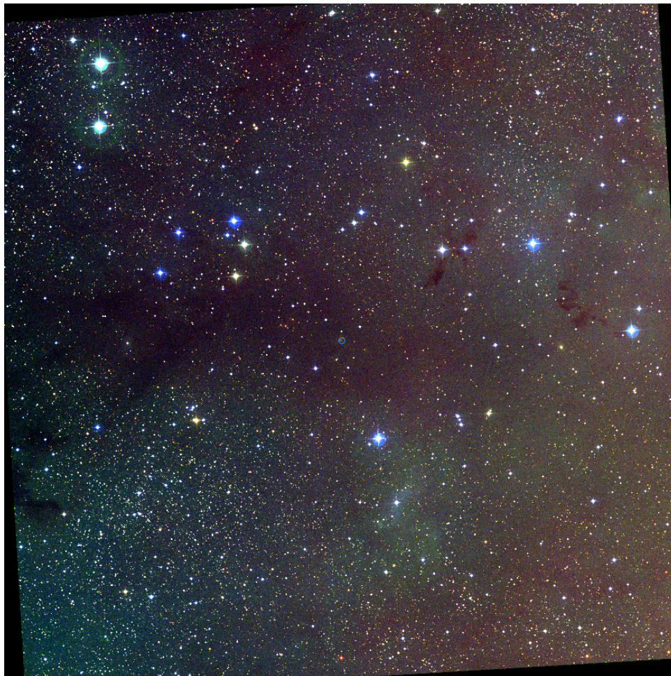
Figure 2: RGB image of Ceph C region. Red: DSS2 IR, green: DSS2 Red, blue: DSS2 Blue. Center coordinates 23h05m51.00s +62d30m55.0s Equ J2000. Image size 1 deg x 1 deg.

Molecular clouds are dense and compact regions throughout the Milky Way where gas and dust clump together, and it is in these cold regions that stars are born. The Cepheus molecular cloud (located generally in the constellation Cepheus) is a site of triggered star formation due to the interaction of the molecular cloud and the expanding HII region S155. This region, called Ceph OB3, contains individual sub-clouds within the greater cloud, referred to as Ceph A-F (identified and labeled by Sargent 1977). These regions are known areas of active star formation but not well observed from ground-based optical observatories or space based missions in the past. The first photometric study of the entire Cepheus molecular cloud was done by Blaauw et al. in 1964 and identified 40 early-type stars in the cloud at a distance of approximately 725 parsecs. Several other studies in the 1970's (also photometry based) refined the Blaauw list and expanded it to include fainter sources, though sources that are still bright by today's standards.