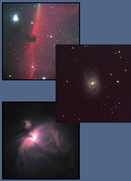
A selection of astrophotos taken by students at the NSO. Using basic post processing techniques and readily available software, projects are endless.