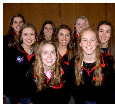
Students from Breck School in Golden Valley, MN.