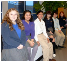
Participants from Carmel Catholic High School in Mundelein, IL.

This research project has provided the students with higher-level thinking skills not addressed in a typical high school course. Students achieved insight into how authentic science research is conducted. This project grew out of previous NITARP projects. Three high school teachers and their students collaborated to study these 16 objects in UCL.