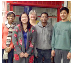
Participants from Walter Payton College Preparatory School in Chicago, IL.